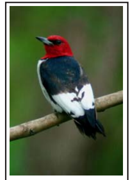
Red-headed Woodpeckers love acorns

A. Yes. As I refered to in question #1, the cool, wet summer has had a very positive effect on the sunflower crop this year as well. As I type this, bulk bird seed prices have already declined once and I anticipate another drop to happen soon. Check with us as soon as you read this and I should know what the prices are going to be for the winter.