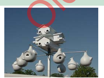
They may not be back until March, but Purple Martin Houses are great gifts.