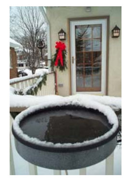
Heated Birdbaths are a "hot" seller!