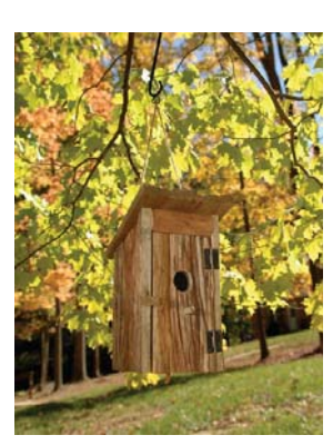
How many uses can you think of for the Outhouse Birdhouse?.

Most of our customers are coming in for bird feeders and houses to use in the traditional manner. A surprising number of them can be used in other ways around the house. If you are, as I am, a bird lover who likes to have your hobby represented in your decorating, we can help. Aside from our gift items like the great kitchen towels and cutting boards, regular feeders and houses can be adapted for household use. We have a cute gumball machine feeder that we have been using as a people feeder in the store, a beautiful painted seed can that could store anything or even be a wastebasket, an outhouse birdhouse that looks great in the bathroom holding tissues or spare toilet paper and a window feeder that can go on the inside of your kitchen window to hold small pots of herbs. I'm excited about a new cast iron dish feeder what will be holding Hershey's kisses at my house this holiday season. Our long handled feeder brushes could be just what you need to clean the lint out of your dryer. Of course, all of our shepard's hooks and deck arms can be used to hold potted plants or windsocks as well as feeders. The next time you are in, take a look around and maybe you'll see something outside the nestbox.