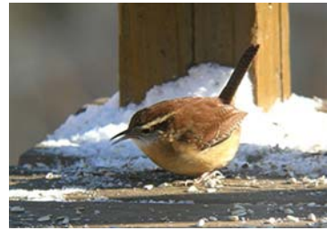
Project FeederWatch has helped us monitor the population growth of birds like this Carolina Wren.