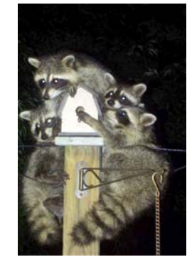
Raccoon Family

Erva Squirrel & Raccoon Baffles Save You Money!