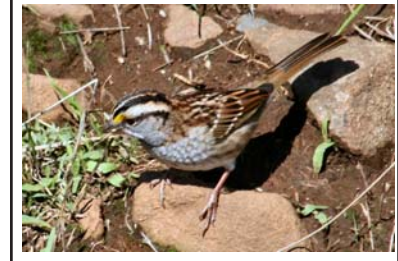
White-throated Sparrow

A. These two native sparrows are among the easiest birds to keep happy. They love white proso millet spread on a flat surface. A nice tray feeder low to the ground helps keep the seed dry but the sparrows are perfectly happy eating right off of the ground.