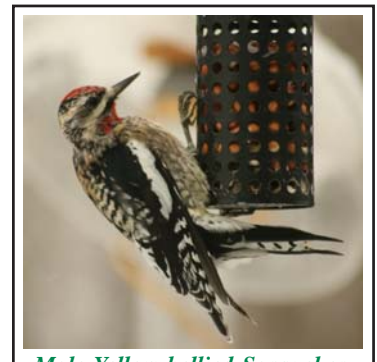
Male Yellow-bellied Sapsucker

Though the name doesn't say it, they are woodpeckers. They are among a group of birds who are known for drilling rows of small holes into living trees so that the sap "oozes" to the surface. The sapsucker and other birds will lick the sap for the sugar energy but they will feast on the insects that are attracted to it. I have seen Ruby-throated Hummingbirds licking the sap in the early spring. Contrary to popular belief, the sapsucker holes