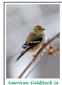
American Goiafinch in winter plumage

A. Absolutely not. You have probably heard me say that birds get about 15% of their daily diets from bird feeders. Now there has been a neat study published on Cornell Lab of Ornithology's website. The study involved tagging Black-capped, Chickadees, Tufted Timice, White-breasted Nuthatchs, American Goldfinches and House Finches with tiny tags that set off sensor attached