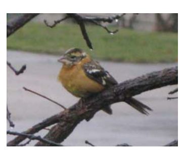
This young Black-headed Grosbeak was a quite rare addition to one of our customer's feeder watch list!