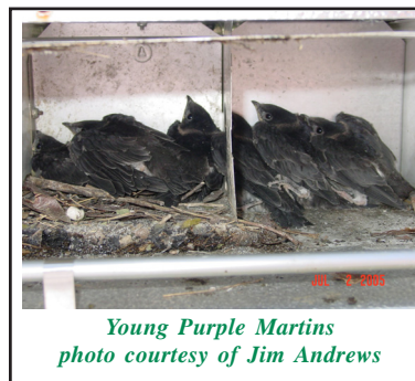
Young Purple Martins

A. Yes. In fact it is encouraged. It has been proven that martins are more successful if you continue to keep sparrows out during their nesting. This is only possible if you have a pole or box that can easily be lowered and raised. Special care should be given to returning the box to the same position it was facing. A sharpie marker works well to give you an alignment guide at the junction of pole sections.