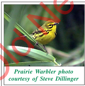
Prairie Warbler