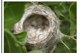
Yellow Warbler's Nest with egg.

Like so many aspects of a bird's life, eggs and nesting is a fascinating subject. The ultimate goal is to make sure their genes are passed along. You can bet that the size of the eggs, the number of eggs laid, the number of nests per season and all factors are genetically imprinted in birds to ensure success.