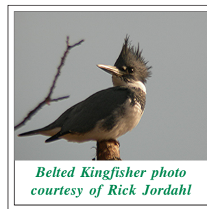
Belted Kingfisher