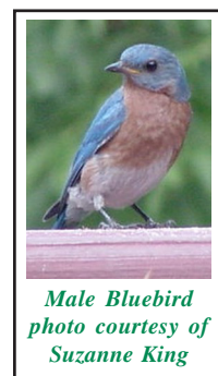
Male Bluebird

A. There are lots of possible answers to this question, but one that we recently spoke with a customer about was the use of "chemicals" in her yard. She appeared to be doing everything right but did admit that they had a lawn service. She admitted that they treated for grubs and worms to keep the moles out. Bluebirds like most birds require access to lots of insects to raise their hungry young. Resist the use of any pesticides if you want to make your yard truly bird friendly.