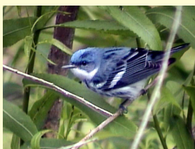
Cerulean Warbler

The Birder's Handbook by Erhlich, Dobkin & Wheye $20.00