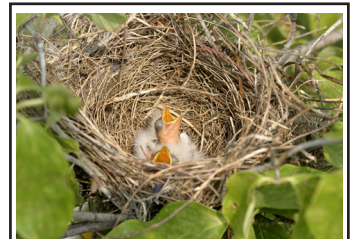
Eastern Kingbird's Nest with Altricial hatchling.