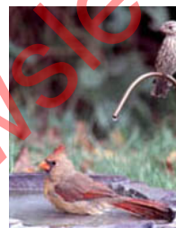
Dripper from Avian Aquatics - $44.99

A dripper does not require electricity, but does require a connection to a water supply. Drippers, as the name implies, provide a steady dripping source of water. We do have one recirculating model that does not require a water source but most do. Some customers are scared off of drippers when we tell them they have to be hooked up to a water source but they really are very simple to operate. They come with a Y-connector that fits on an outside faucet. They also come with 50 feet of hose and a control valve. The amount of water that is “dripping” can be finely adjusted.