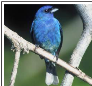
Male Indigo Bunting

Indigo Buntings eat mostly insects, with seeds and fruit for variety. In the spring many of our customers have had them stop at their feeders. Sunflower chips and millet, on the ground or in a feeder, are good seeds for attracting buntings during migration. They usually won't be at your feeders for more than a few days, but while they are, it is breathtaking!!