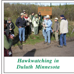
Hawkwatching in Duluth Minnesota

Winter is the time that we schedule the smallest number of outdoor programs for the obvious reasons. This winter we could have been out almost everyday and birded comfortably. The birding was indeed different this year. We had large numbers of robins, bluebirds and raptors all winter, while many ducks just never made it this far south. Our March trip to Smithville Lake was once again the highlight of the season. Five beautiful Common Loons could easily be seen with our spotting scopes, an immature Bald Eagle swooped down and got a fish right in front of us and the Short-eared Owls came out just at sunset.