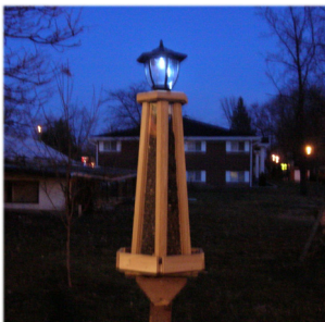
The Lighthouse Feeder from Looker holds 5 quarts of seed and features a solar powered light. $69.99.

"Hey Mom, I thought you said there were sunflower seeds up here".