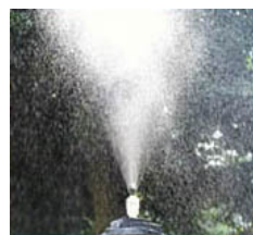
Rock-base Mister by Avian Aquatics - $49.99

Another favorite water mover is the mister . Misters are similar in many ways to drippers but instead of dripping water, it emits a fine spray of water into the air. Misters with a base can be used in a bird bath. Those without bases can be set up to spray into a birdbath or snaked into a bush or tree and allowed to spray into the vegetation. Birds will sit in or fly through the spray or catch water droplets as they fall from the leaves. This is a great way to water plants.