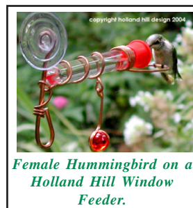
Female Hummingbird on a Holland Hill Window Feeder.

A. I am always conservative when it comes to this topic. Birds get less than 15% of their daily diets from your bird feeders. Hummingbirds are constantly eating from flowers and grabbing an insect here and there. They will get diversity in their diet from nature's offering, your feeders are a great source of quick energy, so stick with a mixture of 4 parts water to 1 part sugar. Never use honey and don't add the red food color (hummingbirds see the feeder, not the nectar so they have no idea what color it is anyway).