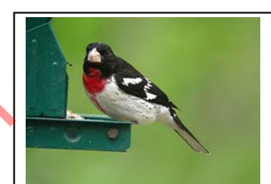
Male Rose-breasted Grosbeaks were common sights this spring at feeders.

Grosbeaks" each time we answered the phone. I wish I had kept a count of how many folks called in but I know it was dozens. It didn't stop with grosbeaks, record numbers of calls came in about orioles, indigo buntings, catbirds and others. What caused this huge influx of birds to feeders? In a word, stress.