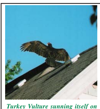
Turkey Vulture sunning itself of a rooftop in Plattsburg.