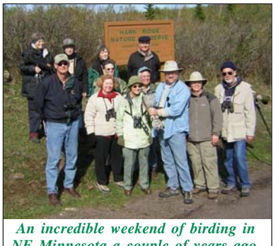
NE Minnesota a couple of years ago. We saw over 300 Sharp-shinned Hawks in one day. Impressive.

space is limited and fill on a first come first serve basis. PLEASE call the store to register (816) 746-1113