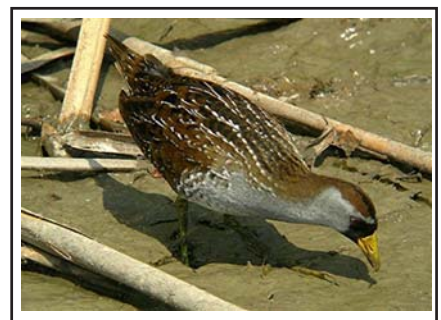
Many of Missouri's IBA sites involve wetlands. Sora (a rail)

The Important Bird Areas program has been around for several years now and is