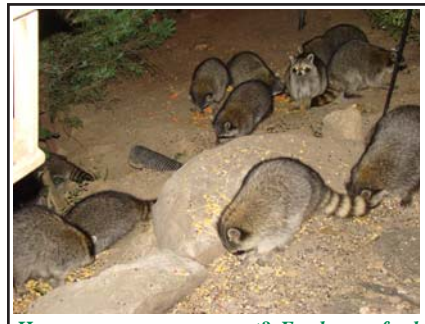
How many can you count? Feed one, feed them all. Don't let this become your backyard.

A. It is definitely true. The Missouri Department of Conservation recommends that you do not intentionally feed critters such as raccoon and deer. There are many reasons but the picture here should illustrate the point well. One little masked bandit is cute but 17 are nothing but trouble. What do they do when the free food runs out? Trash cans, dog bowls, grill covers, anything that smell remotely like food is fair game. On top of all that, don't forget that raccoons can carry rabies and distemper. Raccoon baffles from ERVA are super effective at keeping these rascals from climbing your feeder poles.