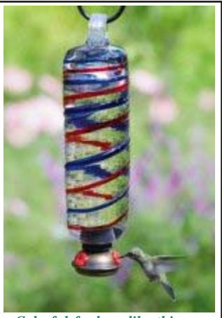
Colorful feeders, like this one from Par-a-sol, attract hummers as well as other all red feeders.

A. Some are convinced that if they do not put the red food coloring in their feeders, they will lose their hummingbirds. The truth is, hummers don't know the color of the nectar. They key in on the feeder. More specifically, they key in on the "flower" opennings, stick the tip of their bill in and lap the nectar like a dog. They don't look into the holes to check the color. Clear nectar is fine.