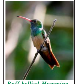
Buff-bellied Hummingbirds are a south Texas specialty.

If you have been to the Lower Rio Grande River Valley in Texas, you probably know that it is one of the premier birding spots in North America. Join us as we revisit the valley with photos and stories from this April's McBirder Adventure.