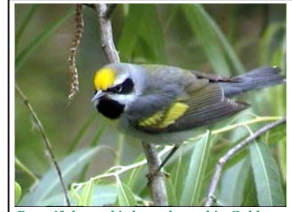
Beautiful songbirds such as this Goldenwinged Warbler are on the RED list of Birds of Conservation Concern. They are targets for protection by ABC.

Like everyone featured in this column, ABC is a private, nonprofit that counts on donations to support all that they do. Please consider sending something to help them out.