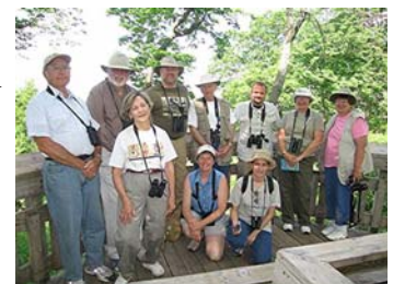
Weston Bend Birders at the Missouri River Overlook

I know if you are a regular reader, you know I talk about birding at Weston Bend a lot. I don't think I have ever explained how important that area is for our birds. When you look at the Missouri river from Kansas City to St. Joseph, the land is quite open and flat. If you can imagine yourself a small bird flying from Central America to Northern Canada each spring, your life depends on places that you can take time to safely find lots of food and clean water. By far the most lush tract of forest along your important travelway is the area on both sides of the river near Weston/Leavenworth. The combined areas of land protected by Ft. Leavenworth and the Missouri Department of Natural Resources is beautiful. Weston Bend is a fairly young park. It was established in 1980 and protects 1,180 acres of habitat and has several wonderful trails and an overlook platform that shouldn't be missed. Located on 45 Hwy just south of Weston, I recommend visiting this and many other of our fine state parks often.