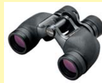
Nikon Superior E 8X32 - voted the Best Birding Binocular in the world by www.betterviewdesired.com for the past 10+ years. Amazing clarity and color, wide field of view, just incredible optics for the price. They have been $699.99 for years, I have 3 pair available for $560.00.