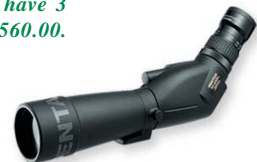
Pentax PF-80EDA with 20X60 Zoom Eyepiece - it only takes one look through this scope to see why it has been rated as the Reference Standard for large spotting scopes by www.betterviewdesired.com since its release. Most of its competitors cost twice, even 3 times as much money for equal results. They have been $1,099.99 for years, I have 3 available for $999.99.