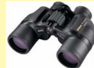
Nikon Action 8X40 (Clamshell) - our best selling binoculars which normally sell for $69.99 Sale Priced at $52.99