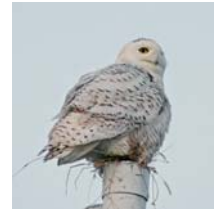
This beautiful female Snowy Owl spent most of this winter near Breckenridge, MO

What happened to the winter? December started out like we were going to be in for a real old fashioned hard winter, then . . . poof! I thought the large number of birds sticking around this winter was due to the huge surplus of natural food that resulted from our wet summer. Perhaps the real reason was that birds are better at long range winter forecasting than our weathermen. The number of robins that wintered here were noticed by almost everyone and many really good birds visited our area. But, for the most part, winter birding had to be classified as pretty boring.