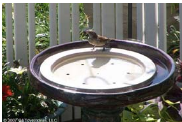
The floating Bird Bath Raft makes water features that are too deep for birds, perfect for them.

or solar powered devices recycle the water with a pump, then the water cascades over a fiberglass “rock” making a great bubbling sound as it strikes the water again. That sound is like a magnet for birds.