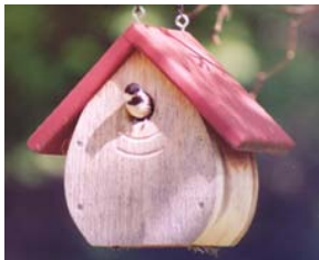
Kettle Moraine Wren/ Chickadee Nest Box.

Pre Sort Std. US Postage Paid Permit 350 Kansas City, MO