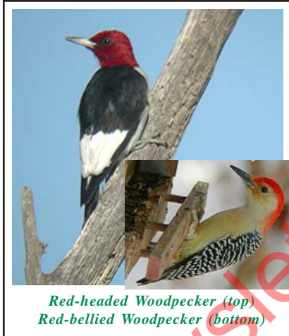
Red-headed Woodpecker (top) Red-bellied Woodpecker (bottom)

Depending on food supply and weather severity, Red-headed Woodpeckers may be seen in our area year-round. Unfortunately, Red-headed Woodpecker populations have declined severely due to increased nest site competition from European starlings and from removal of dead trees.