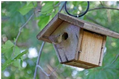
House Wren on a Mor-Bilt Wren House

2nd Week of May - Peek Migration for Warblers, etc.