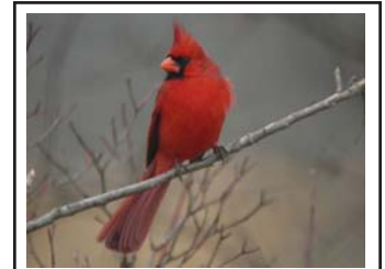
Male Northern Cardinal

What was the first bird you can remember learning? For many of us it was the Northern Cardinal ( Cardinalis cardinalis ). The bright red plumage of the male with its tall crest and large orange bill make it one of the most identifiable birds in the world. Primarily a southern species, the "Cardinal Grosbeak", as it was once known, is a resident now in all but a few northwestern states. Milder winters and urbanization has enabled the cardinal to expand its range over the last century. In other words, cardinals have adapted quite well to human disturbance.