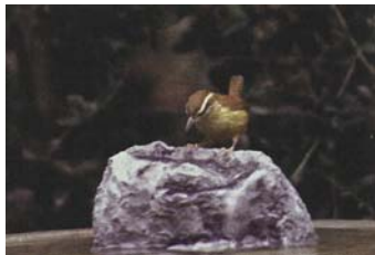
A Granite Bubbler from Avian Aquatics keeps the water moving and makes a great sound.

If you want to add to the number of birds using your yard this spring, get your water moving. All birds need water and your resident birds know where to find your bird bath at all times. Migrating birds, on the other hand, are totally lost when they stop in your yard during their long journey. A way to help them find the all important water source is by making your water move and make noise.